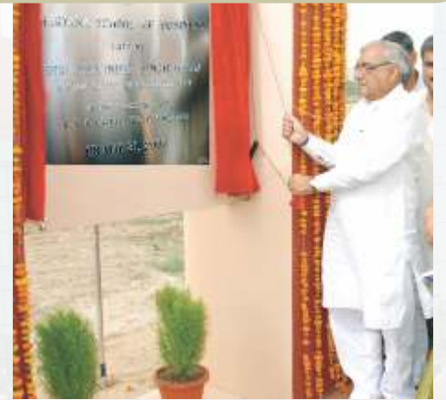
Chief Minister Sh. Bhopinder Singh Hooda lays foundation of Haryana School of Business on 31st May, 2008